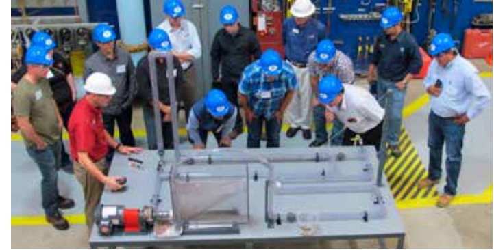
Lab demonstrations include a miniature, see-thru slurry system and full sized pipeline tests of settling and non-settling slurries.

Transportation of Solids Using Centrifugal Pumps