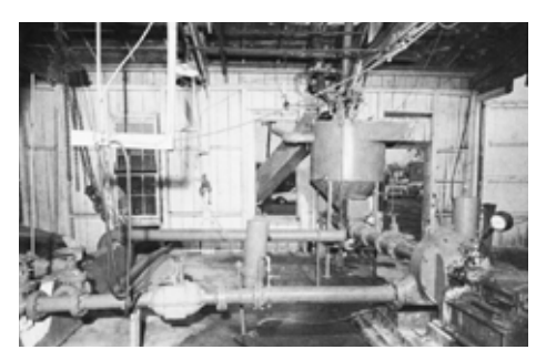
The Hydraulic lab in 1956

GIW Industries, Inc. is the recognized leader in design, manufacturing, and application of heavy duty centrifugal slurry pumps. GIW's rich history in pump and pipeline testing began in 1956 with a facility focused on analyzing customer pumping problems and recommending solutions.